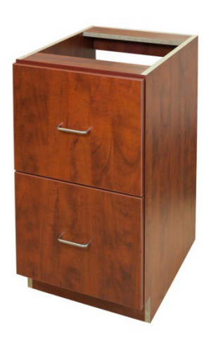
Base 2 drawer cabinet