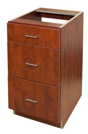
Base 3 drawer cabinet, top drawer 6"