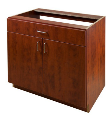
Base 2 door, 1 drawer cabinet