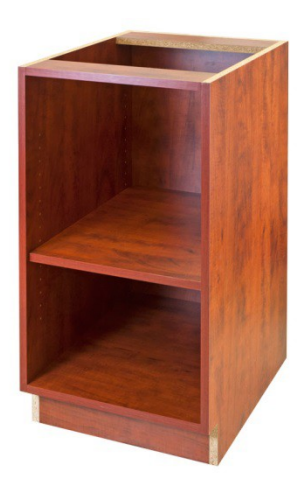
Base open cabinet